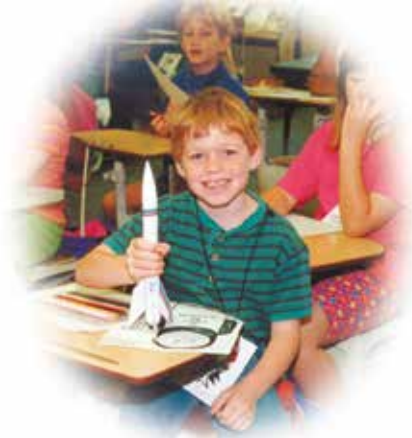
Aerospace Education in All Grades

in which we live. CAP's involvement in aerospace education includes sponsorship of workshops for teachers, and development of curriculum and other materials to help teach aerospace education to all grade levels.