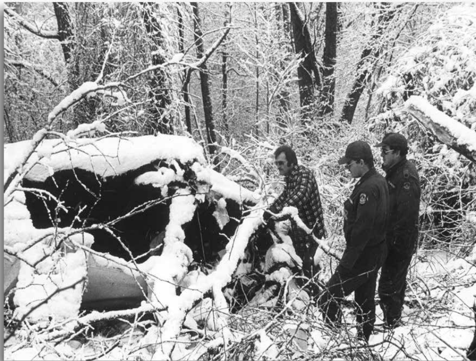
Experts will be assisting in determining the cause of this crash.

The NTSB is responsible for determining the cause, or probable cause, of any transportation accident. Under the chairman of the NTSB, the Bureau of Aviation Safety carries out these duties in the area of aviation. The Bureau of Aviation Safety makes rules governing accident reporting. They also investigate all aircraft accidents (they have delegated this duty to the FAA in the case of general