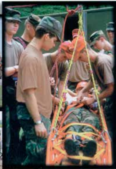
CAP Emergency Services

in which we live. CAP's involvement in aerospace education includes sponsorship of workshops for teachers, and development of curriculum and other materials to help teach aerospace education to all grade levels.