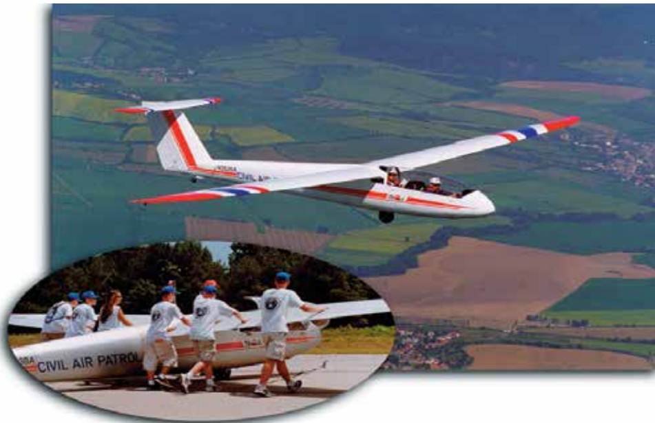
CAP Cadets experience flight.

CAP was founded in 1941, and for 60 years, the CAP members have been involved in service to their communities and their nation.