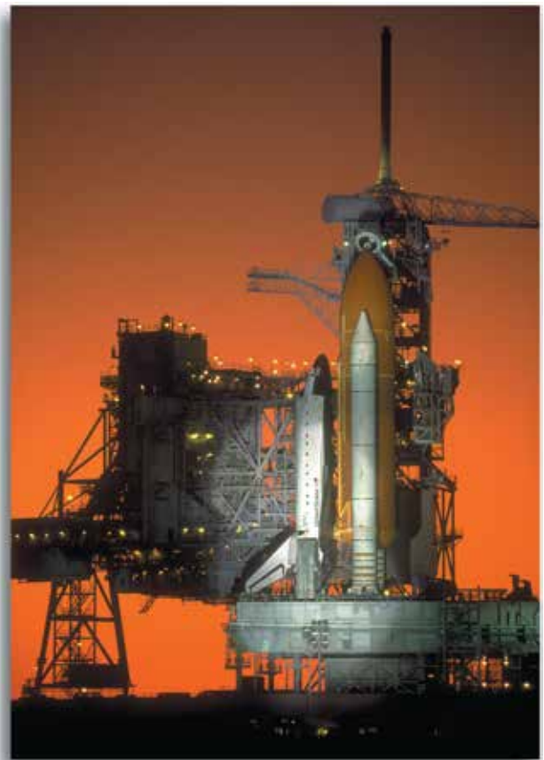
America leads the world in aerospace technology.

NASA's mission statement is threefold and is directly supported by the strategic enterprises. The first part is to explore, use and enable the development of space for human enterprise. The second part is to advance scientific knowledge and understanding of the earth, the solar system and the universe and use the environment of space for research. The third part is to research, develop, verify and transfer advanced aeronautics, space and related technologies. NASA contributes a great deal to the goals of the United States and the world. It promotes economic growth and security to America by conducting aeronautics, and space research and development in partnership with industry, academia and other federal agencies to keep America capable and competitive. It helps to preserve the environment through studies of earth as a planet and a system, enabling the world to address environmental issues. It engages the educational world by directly supporting and encouraging