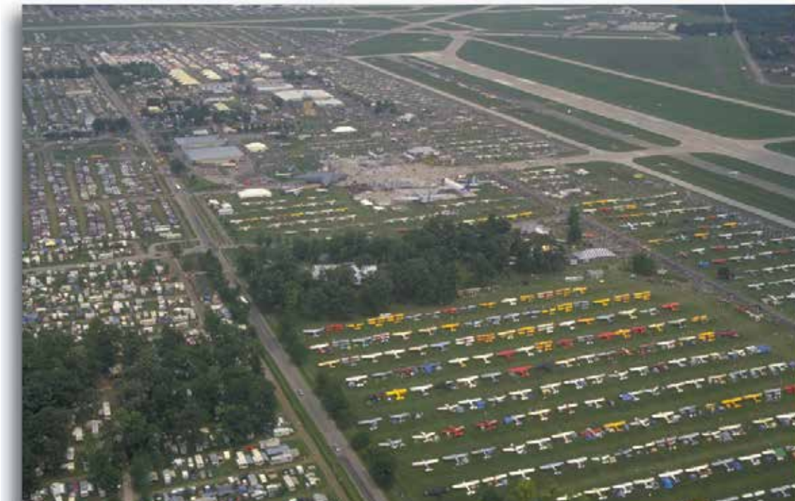
The EAA Annual Fly-in in Oshkosh is the world's largest airshow.

holds one of the largest airshows in the world at Oshkosh, Wisconsin. During the weeklong airshow, it becomes the busiest airport in the world, logging more takeoffs and landings than the busiest commercial airports in the world. At the airshow, there are many events that teach and inform builders and pilots on new rules and laws, building techniques and new aircraft. It also sponsors workshops and provides hands-on training in aircraft construction and maintenance.