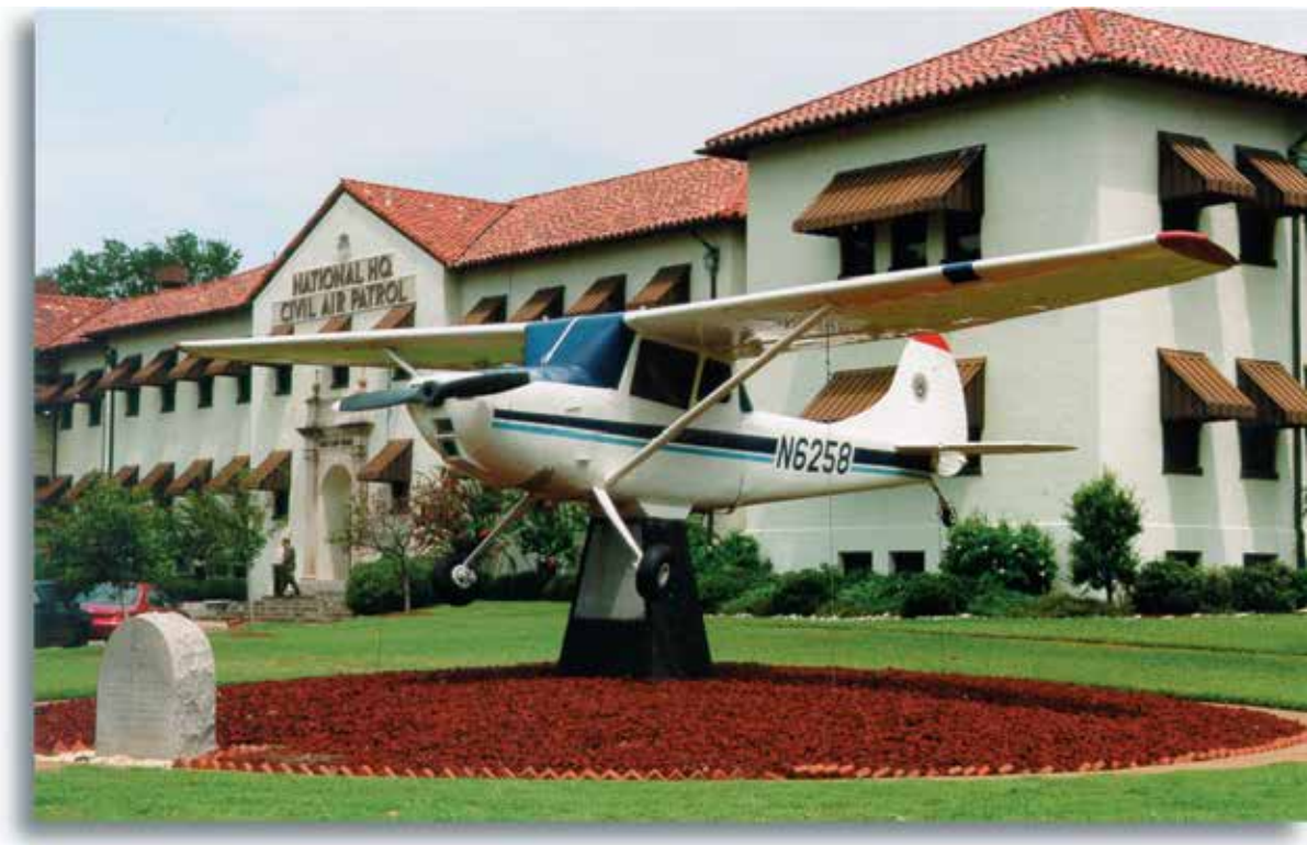
National Headquarters Civil Air Patrol, Maxwell Air Force Base, Alabama

The Civil Air Patrol (CAP) is a federally chartered, private, nonprofit corporation and is also the official civilian auxiliary of the United States Air Force. The over 60,000 volunteer members are aerospace-minded citizens dedicated to service for their fellow Americans. CAP has three basic missions—emergency services, aerospace education, and cadet programs.