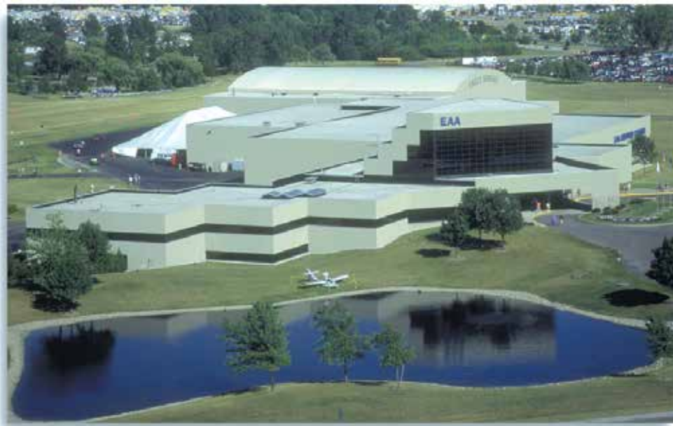
EAA Headquarters, Oshkosh, Wisconsin (EAA)

One of the fastest growing areas of aviation is the homebuilt market. The EAA was formed to help builders to safely construct and fly their aircraft. It is one of the largest general aviation organizations, along with AOPA. Its local chapters provide builder training and education. EAA supports all sport aviation including antique aircraft, warbirds and ultralights. It also works with the government to ensure the voice of general aviation is heard and understood. Each year, it