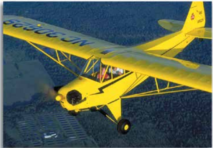
One of the greatest training planes of all time, the Piper J-3 (EAA)

The majority of pilots have received their basic instruction in either Cessna or Piper aircraft. They are small, two-seat aircraft with small engines. They have a low cruising speed and are very easy to fly. These characteristics help develop confidence in the beginning student. The fact that they are also inexpensive to buy, operate, and maintain makes them attractive to flight schools.