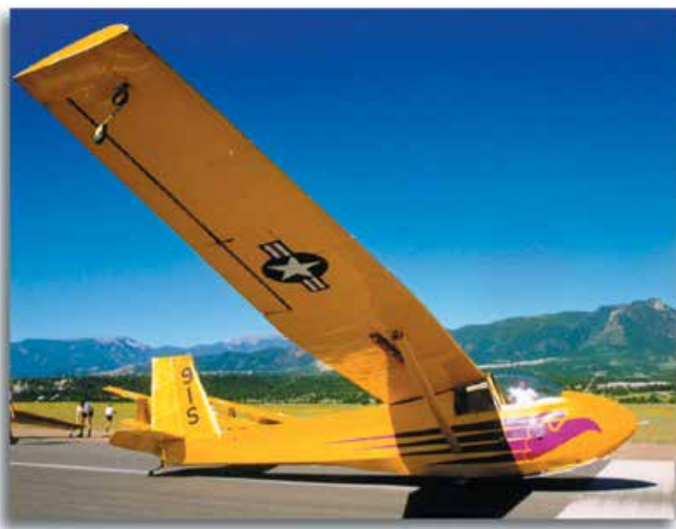
The TG-4A sailplane was used to train Air Force Academy cadets.

There is a group of aviators who fly unpowered sailplanes. Their sport is often called soaring or gliding, but there is a big difference between the two. Gliding is the controlled descent of an unpowered aircraft while soaring is flying without engine power and without loss of altitude. If a sailplane is towed up to altitude and after release it descends to a landing, that is gliding. Similarly, if a person with a hang glider jumps from a high place and descends to a landing, that is gliding. Soaring, on the other hand, involves finding and riding air currents so that the aircraft remains aloft or even gains altitude.