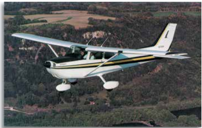
Cessna 172 Skyhawk

The Cessna 172 Skyhawk has a 160-horsepower Lycoming engine and a fixed-pitch propeller. It also has fixed (non-retractable) landing gear. The Skyhawk has a payload of