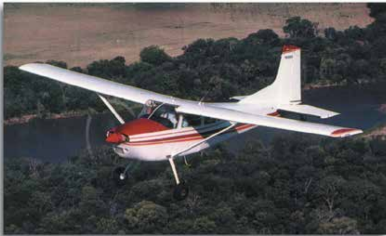
Cessna’s venerable Skywagon

The Cessna 185 Skywagon is a “tail dragger.” You will notice in the figure that the Skywagon has