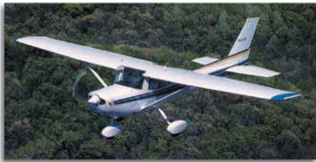
This is the successful Cessna 152. Thousands of pilots have received their entry-level flight training in this aircraft.

This basic trainer went into production in 1978 to replace the well-established Cessna 150. It is 24 feet long, has a 33-foot wingspan and a maximum gross weight of 1,670 pounds. It is powered by a 110-horsepower Lycoming four-cylinder engine. At 8,000 feet and using 75 percent power, the Cessna 152 will cruise at 100 mph for about 650 miles. The fuel economy factor is 28 miles per gallon of fuel, which is excellent for an airplane.