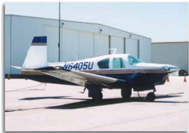
The Mooney 201

The Mooney 201 is an all-metal, low-wing aircraft with a retractable tricycle landing gear. It has a payload of about 1,000 pounds and a 1,100-mile range. The Mooney 201 is powered by a 200-horsepower Avco Lycoming engine, which gives it a cruising speed of 160 to 190 mph. There’s an interesting bit of trivia about Mooney. At one point in their manufacturing history, they produced an airplane that had a Porsche engine in it!