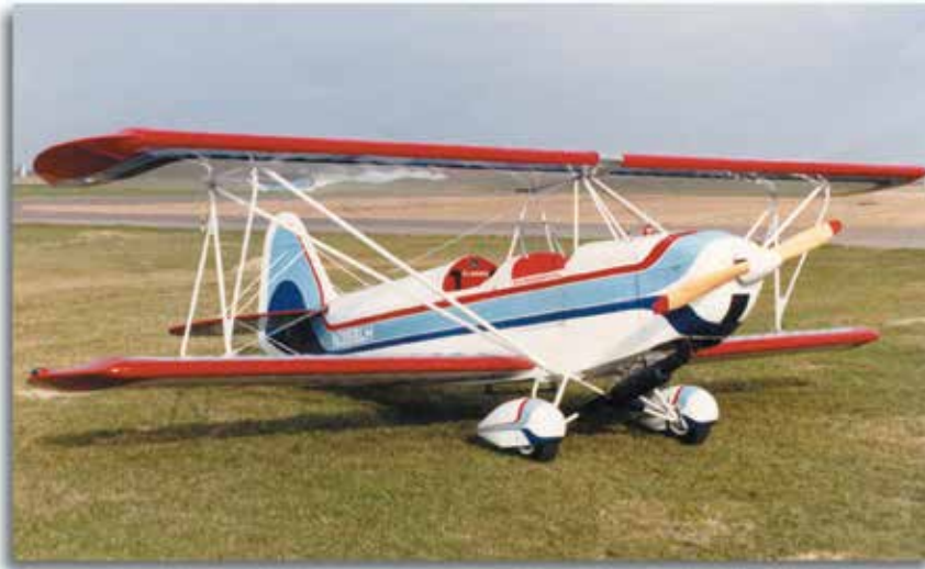
The FFP Classic

This phase of sport aviation combines the love of flying with the hands-on hobbies of woodworking, fabrics, welding, metal working and composite construction. In this endeavor, the pilot actually builds the airplane either from a kit or from a set of plans. For many, the incentive is that they can become an airplane owner by building their own aircraft much more cheaply than by buying one. They can also build an airplane that is sportier looking than a factory-built airplane, or they can even build a replica of a famous “warbird.” The prices vary from only a few hundred dollars for the plans to complete kits costing well over $100,000. A variety of engines are available from two-stroke to modified automotive 4s, V-6s, V-8s and custom built V-12s.