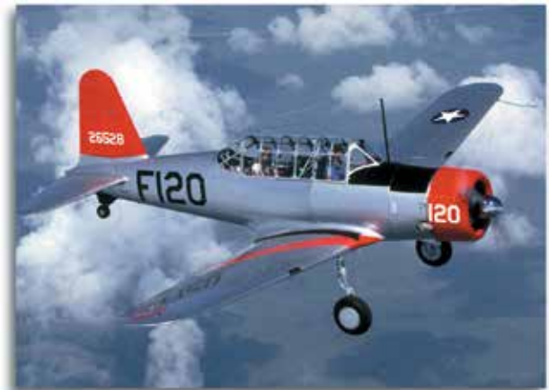
One of the great warbird trainers, the Consolidated Vultee BT-13

to restore a Piper J-3 Cub may cost $20,000 in addition to the $3,000 to $5,000 purchase price. Some of the very rare aircraft can easily cost over $100,000.