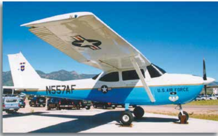
The Air Force Academy T-41

From the early 1920s until the beginning of the 1980s, names like Cessna, Beechcraft and Piper were synonymous with general aviation. The vast majority of all the general aviation aircraft flying anywhere in the world were manufactured in the United States. Most of them were built by Cessna, Piper and Beech Aircraft, and were built before 1980.