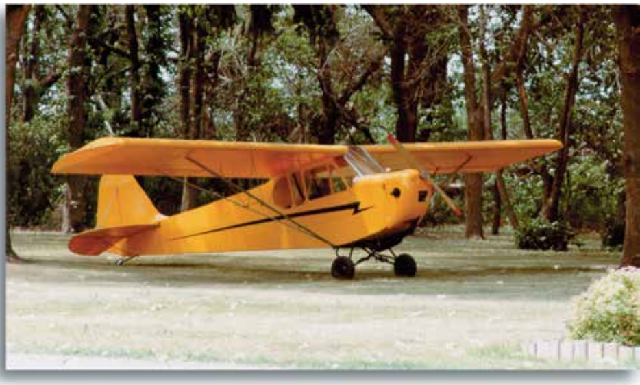
Fisher Flying Product FP202 Ultralight