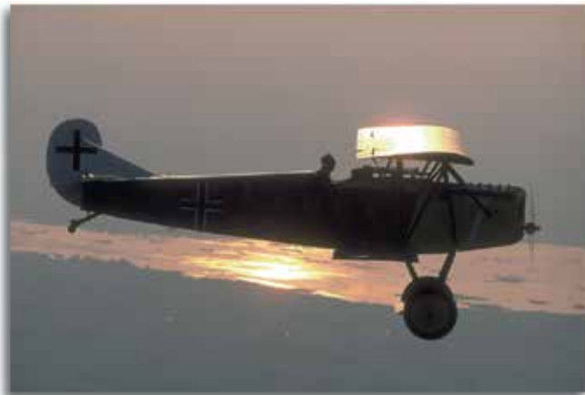
Antique Airplane (EAA)

In order to qualify as an antique, an aircraft must be at least 20 years old. This area of sport aviation is very expensive and generally attracts people from the higher-income levels. When restoring an old aircraft, it is often impossible to obtain the parts you need, so they have to be handmade. For example,