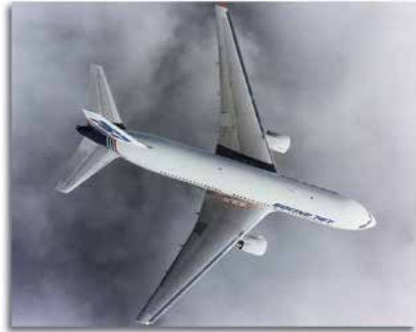
The Boeing 767-200

The basic version of the 767 can serve such medium-length routes as San Francisco to Chicago, Los Angeles to Miami, or London to Cairo. The advanced transcontinental version (767-300) can operate nonstop between New York and Los Angeles.