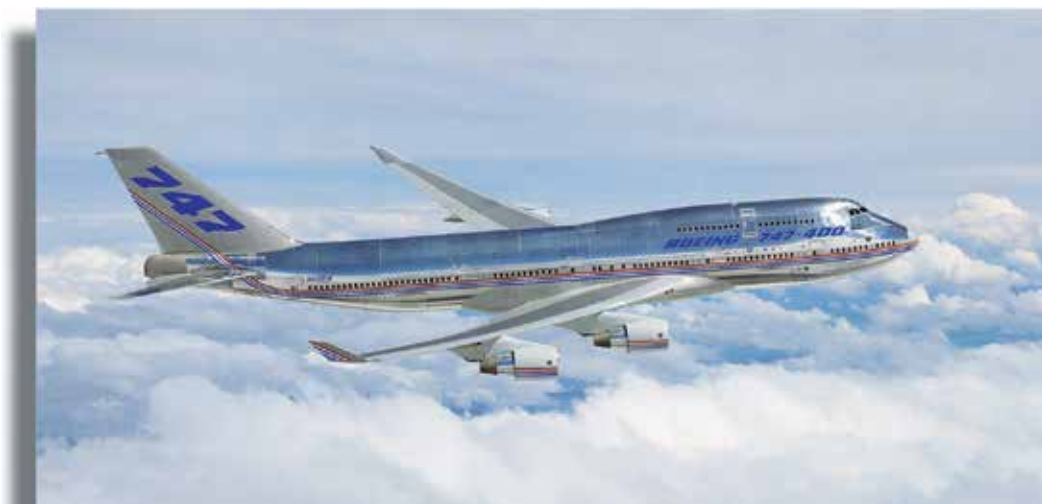
The Boeing 747

This is the largest commercial airliner ever built and it deserves the name jumbo jet. There have been about 700 of the giant Boeing 747s built in 15 models. The 747-100 and 747-200 have been produced in