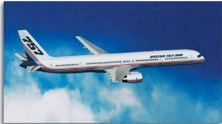
The Boeing 757

Savings with the 757 are not limited only to fuel. The 757 is certificated for a two-crew member operation, whereas the 727s they replace are all operated by three crewmembers. This factor can result in a $9 million per year savings for a 10-aircraft fleet. New, lower-maintenance systems can save the same 10-aircraft fleet an additional $2 million per year.